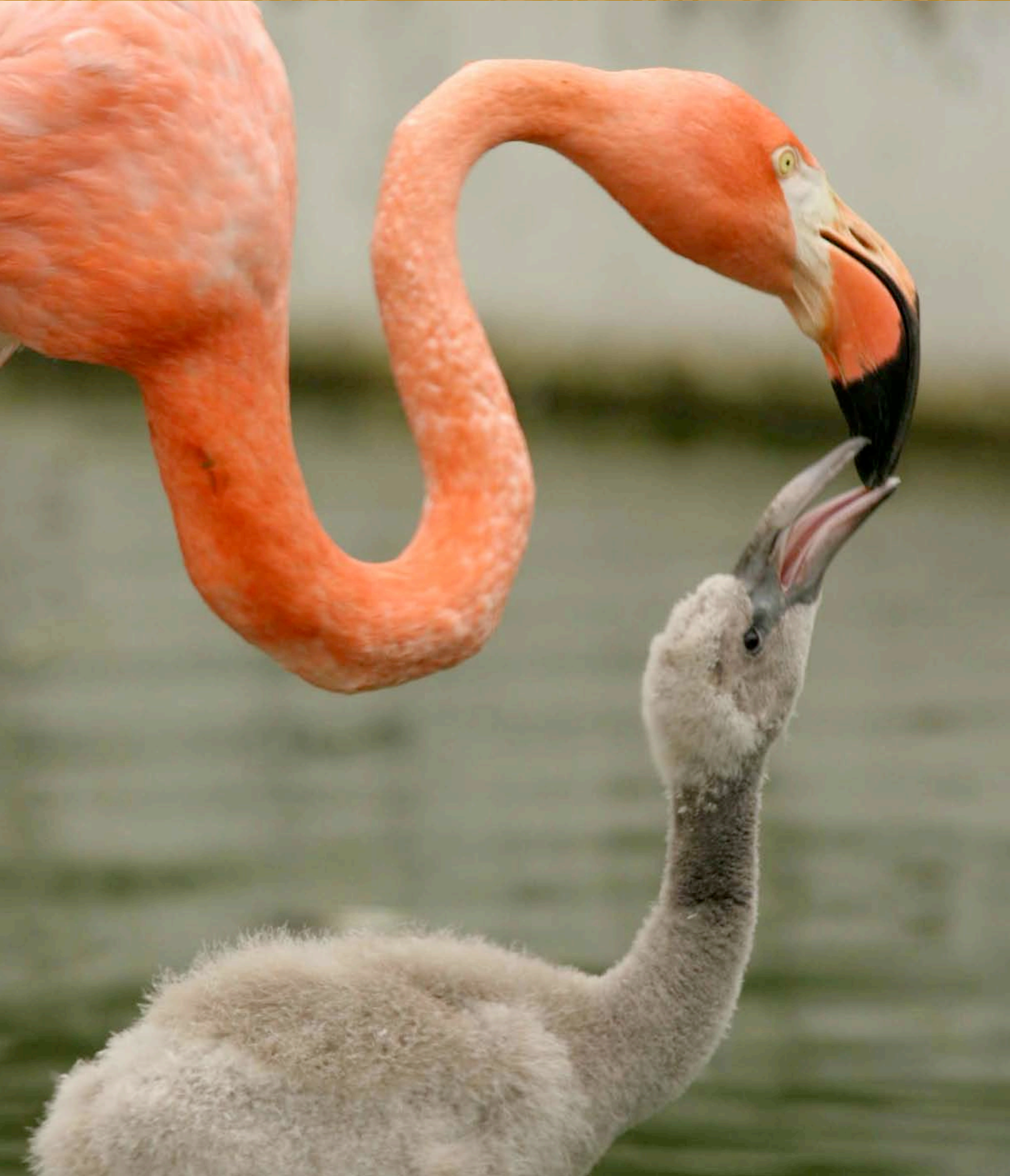
A Caribbean flamingo feeds its young at Stone Zoo.