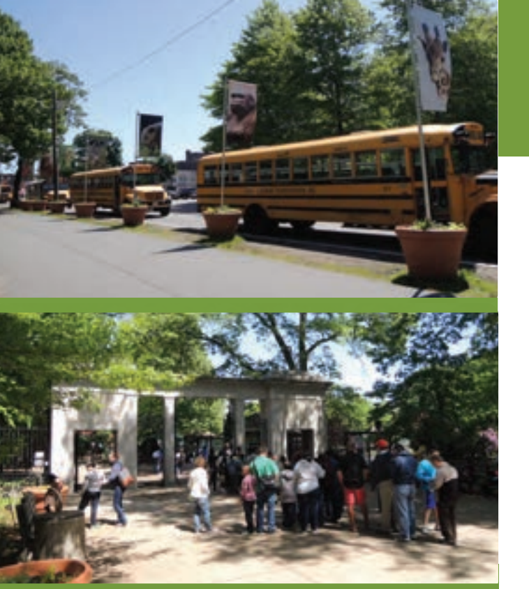
Bus drop off and main entrance (zebra entrance) for group leader check-in. Groups will wait on green spaces for their leaders to return.